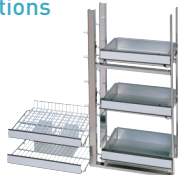
MPR-31RR Wire shelves (left), Sliding racks (right)